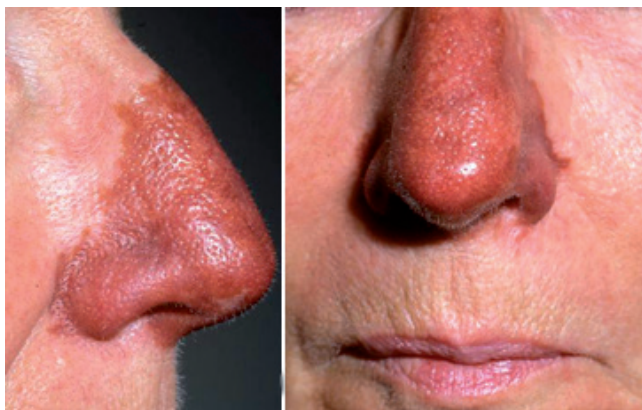
Fig. 1. Intense reddish-brown discoloration with sharp margins to healthy skin.

A 66-year-old Caucasian woman was referred to the Department of Dermatology at Karolinska Hospital because of redness of the nose. Clinical examination showed telangiectasias and discrete sebaceous hyperplasia of the dorsum and lateral aspects of the nose. The clinical diagnosis was rosacea and early rhinophyma. The area was treated with dermabrasion, followed by the application of ferric chloride solution for haemostasis. Two weeks later the treated area presented with an intense reddish-brown discoloration with a sharp demarcation to untreated skin (Fig. 1). A punch biopsy from the periphery of the brownish area showed a band-like fibrosis in the papillary dermis with ferrugination