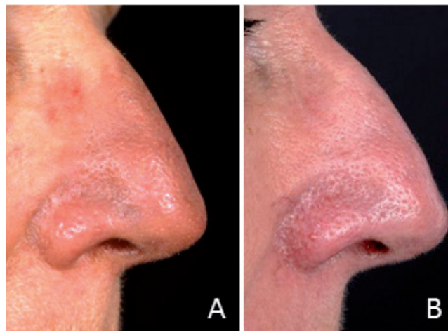
Fig. 3. Follow-up after treatment with adapalene at (A) 2 months and (B) 20 months.

of collagen bundles and numerous siderophages (Fig. 2A). The presence of iron was confirmed by Prussian blue staining (Fig. 2B). A small test patch was then treated with carbon dioxide laser ( \text{CO}_2 laser) and showed no improvement regarding discoloration during the following months (Fig. 3). In an attempt to increase the cellular turnover of the skin, and thus enhance the wash-out of the pigment, adapalene 0.1% cream was applied on a regular basis. An almost complete clearance of the skin discoloration was achieved after twenty months.