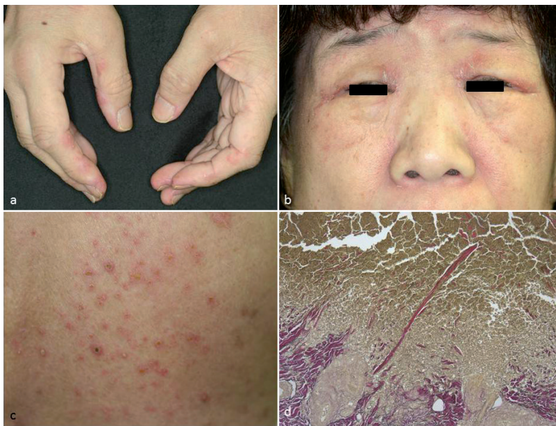
Fig. 2. (a) Keratotic erythema on the bilateral radial aspects of the fingers. (b) Facial erythema and heliotrope rash. (c) Multiple hyperkeratotic umbilicated nodules on the back. (d) Histopathology showing degenerated collagen bundles vertically eliminated through the epidermis (Elastica van Gieson stain) ( \times 400 ).

ching may cause microtrauma and necrobiosis of the dermal structures. Follicular occlusion caused by altered differentiation of the epithelium may induce ARPC; however, it is rare for ARPC to occur in patients with dermatomyositis. Only one case of ARPC, occurring in a patient with dermatomyositis who had no diabetes, has been reported recently (3). In this case, nodular lesions developed within the poikiloderma, in parallel with relapse of myositis. The authors speculate that scratching due to severe itching and inadequate dermal circulation caused by interstitial oedema may induce ARPC. In our 2 cases, HbA1c levels were within the upper limits, but neither patient had uncontrolled diabetes or renal dysfunction. The other reported case (3) and our 2 cases were females, and systemic examination by computed tomography (CT), magnetic resonance imaging, Gallium scintigraphy, and positron emission tomography-CT did not reveal any internal malignancies.