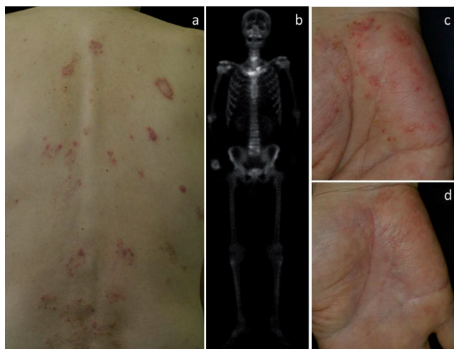
Fig. 1. (a) Scaly erythemas with tiny pustules were scattered on the back (Case 1). (b) Bone scintigraphy showing increased uptake in the right sternoclavicular joint and bilateral knees, and also sinusitis. Palmar lesions (c) before, and (d) after antibiotic therapy.

Case 1. A 60-year-old man had been treated for PPP for 3 years. He was a non-smoker. Two months previously, his skin eruptions suddenly worsened and spread beyond the palmoplantar areas. Simultaneously, severe joint pain appeared on the sternocostoclavicular areas, shoulder and sacroiliac joints. On physical examination, small pustules and scales were detected on the erythematous lesions on the palms and soles. In addition, scaly erythema and solitary pustules, which were sterile, were scattered on his trunk (Fig. 1a). Laboratory examination showed increased levels of C-reactive protein (CRP, 3.8 mg/dl, normal 0.00–0.30), white blood cell (WBC) count (9,800/ \mu l, normal 3,800–9,800/ \mu l), and normal anti-streptolysin O (ASO) titres were elevated (289 IU/ml, normal 0–244 IU/ml). Bone scintigraphy revealed increased uptake in the sternocostoclavicular joints (Fig. 1b), and X-ray of the head revealed dento-alveolar abscess and subsequent sinusitis. Administration of clarithromycin and application of corticosteroid ointment for the skin lesions resulted in improvement in both skin lesions and joint pain (Fig. 1c, d). Thereafter, only slight scaly erythema appeared occasionally on the soles during a 4-year follow-up period, with no recurrence of joint pain.