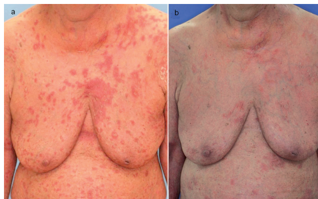
Fig. 2. Clinical findings of skin eruption exacerbation after (a) the fifth infliximab injection and (b) after 5 sessions of granulocyte/monocyte adsorption therapy (GMA). Skin eruption was considerably improved after GMA, with alleviation of fever.

A 60-year-old Japanese woman presented with a history of psoriasis vulgaris with psoriatic arthritis for 50 years. She had experienced frequent pustular psoriasis from the