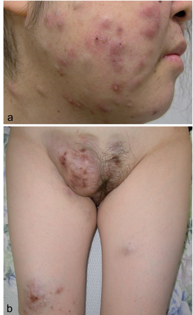
Fig. 1. Clinical features. (a) Multiple subcutaneous cystic tumours and erythematous plaques on the cheek and neck. (b) Well-demarcated, multilocular, subcutaneous cysts in the pubic region and on the right thigh.

infection. Thus, deep pseudocystic dermatophytosis caused by T. rubrum was diagnosed. Large cystic tumours were aspirated and excised to remove the purulent matter. The patient was treated with itraconazole (200 mg daily) for 4 months. Because the serum concentration of tacrolimus gradually increased due to the itraconazole, the patient was treated with terbinafine hydrochloride for 2 years. Finally, most of the cystic tumours disappeared, and the serum beta-D-glucan level returned to normal.