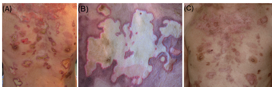
Fig. 1. (A) Several geographic-shaped unhealed ulcers covered with yellowish necrotic tissues on the chest and abdomen. (B) Close-up of one geographic-shaped ulcer on the lower back. (C) Complete re-epithelialization of lesions 3 months later.

Co-infection of CMV with other human herpes virus, mostly HSV and varicella-zoster virus (VZV), is common in HIV-positive patients, putting the pathogenetic role of CMV in cutaneous lesions in question (3). However, Choi et al. (2) conducted a study in 9 non-AIDS, immunocompromised patients, which revealed that CMV skin lesions were not highly associated with HSV. They proposed instead that CMV contributes to skin lesions in these patients.