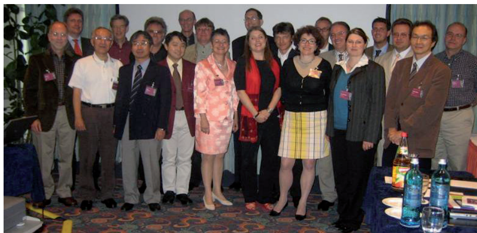
Fig. 1. The 21 founding members of the International Forum for the Study of Itch (IFSI) (25 September 2005).