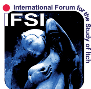
Official logo of IFSI.

About the International Forum for the Study of Itch