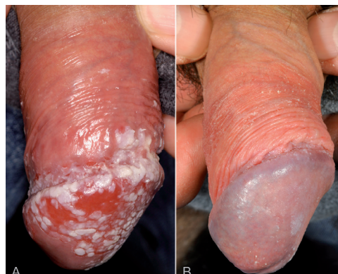
Fig. 1. (A) Penile pemphigus. On initial evaluation, there were widespread erosions of the glans penis and of the corona glandis with denuded areas. The epithelium was whitish, macerated, and could be displaced easily using a cotton tip (Nikolsky sign). (B) Resolution of the lesions following treatment with prednisone and azathioprine.

Case 2. A 35-year-old man was referred for evaluation of a 3-month history of painful penile erosions. Topical treatments with disinfectants and topical antibiotics had no effect. Two months after appearance of the genital lesions the patient also developed painful oral lesions. On examination, the patient had multiple erythematous erosions on the glans penis and sulcus coronarius (Fig. 2). In the oral cavity, the patient exhibited asymptomatic erosions in the region of the palatal arch and the lower lip. Histology from the glans penis showed an intraepidermal bulla with acantholytic cells. Direct immunofluorescence microscopy studies demonstrated deposits of IgG and C3 on the cytoplasmic membrane of the keratinocytes. ELISA-dsg 3 was strongly positive (146 U/ml, normal <7), whereas ELISA-dsg 1 was negative. The patient was treated with prednisone 1 mg/kg body weight and azathioprine 150 mg/day. Furthermore, he received topical betamethasone in combination with topical antibiotics and disinfectants. Under this regimen, the lesions