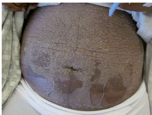
Fig. 1. Confluent, vesiculopustular lesions on the abdomen, associated with extensive erosions and pseudoverrucous features.

A 27-year-old, gravida 2 para 2, Hispanic woman delivered a healthy, full-term baby girl. She underwent tubal ligation on postpartum day one. Several hours post-procedure, she developed a pruritic, erythematous papular eruption on the abdomen. On the second postpartum day, the eruption became diffuse, involving the face, abdomen, chest, back, upper extremities and thighs, with concomitant facial and lip edema. She subsequently developed widespread confluent vesicopustules on her abdomen (Fig. 1) with prominent discrete and coalescing reddish-pink plaques on her upper extremities and thighs. The eruption progressed over the next 12 h with the appearance of pinpoint pustules within the erythematous plaques on the chest, neck, upper extremities and thighs. No mucous membrane or palmoplantar involvement was noted. The patient denied any systemic or constitutional symptoms. She had no known drug allergies, and had received a single 5 million-unit dose of intravenous penicillin during labor for streptococcus Group B colonization, along with morphine and oxycodone with acetaminophen.