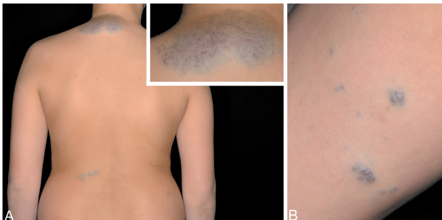
Fig. 1. Glomangioma. Blue-hued, multiple, irregularly shaped, in part confluent, elevated subcutaneous tumours of 0.5–9.5 cm diameter on (A) the back and (B) the right thigh. Inset: large tumour on the upper back.

Tumours with glomus cell morphology are usually benign, very rarely malignant, either solitary or multiple, congenital or acquired (1, 2). Two unrelated forms can be distinguished; the glomus tumour per se and the GVM or glomangioma (3, 4). GVMs are of genetic origin (loss-of-function mutations in glomulin were reported to be causative (3)) and present as disseminated cutaneous glomangiomas commonly in childhood,