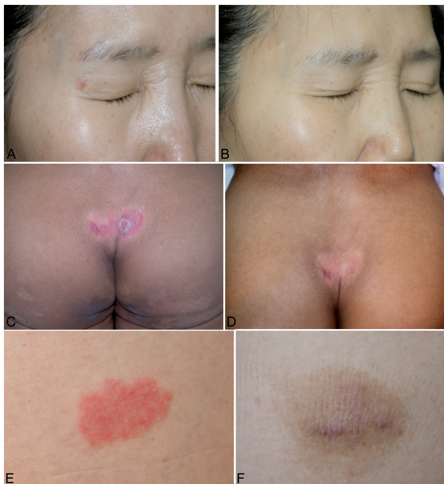
Fig. 1. (A) Clinical features of patient with unilesional mycosis fungoides (MF) before treatment. (B) Complete response was achieved after two sessions of photodynamic therapy (PDT) (case 2). (C) Clinical features of patient with unilesional MF before treatment. (D) Complete response was achieved after two sessions of PDT (case 7). (E) Clinical features of patient with unilesional MF before treatment. (F) Complete response was achieved after five sessions of PDT (case 4).

The mechanism of PDT in MF is not yet completely understood. In addition to the direct destruction of