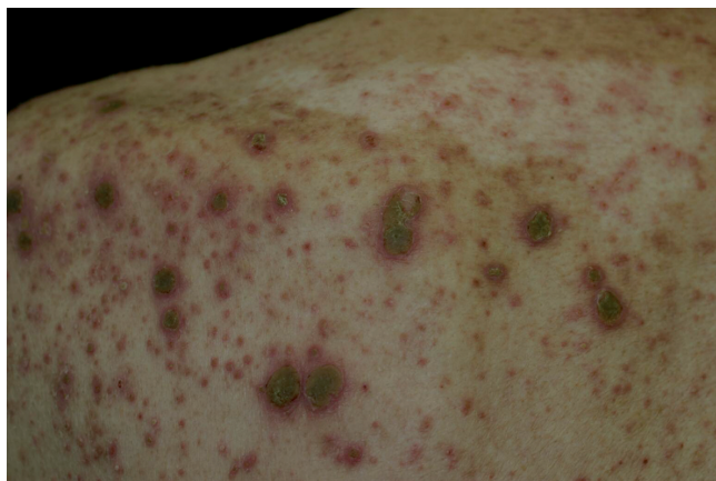
Fig. 1. Hyperkeratotic umbilicated nodules intermingled with acneiform small follicular red papules on the back.

Physical examination revealed a number of nodules with keratotic plugs on his upper back and shoulders (Fig. 1), along with numerous acneiform red papules and pustules on the trunk. Periungual granuloma was found on the second and fourth finger of the right hand, and the third finger of the left hand. Further vitiligo lesions were seen on the head, back, dorsa of hands and fingers, which appeared over 20 years ago. Labo-