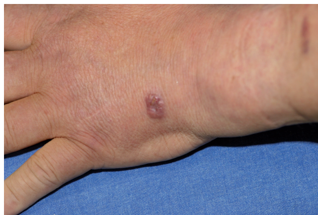
Fig. 2. Erythematous lesion with an infiltrated sporotrichoid pattern.

A 60-year-old man was first seen at our department with multiple nodular lesions involving the nose and the right cheek, which had developed over a period of more than 4 months with gradual aggravation. In addition, a new lesion had developed on his left hand 2 months later. The patient had been treated unsuccessfully with oral antibiotics by his referent physician. His medical history was remarkable for rheumatoid arthritis, for which he had frequently undergone uncontrolled courses of oral corticosteroids (40 mg prednisone daily) over the last 10 years. Of note, the patient acknowledged having fallen when working in his garden 5 months previously, with multiple excoriations on the skin on his face. Physical examination revealed multiple tender subcutaneous nodules of varying size, involving half of his right face, including his nose, cheek and sub-palpebral skin, with a pseudo-verrucous aspect and small necrosis at the edge of the nose (Fig. 1a). Another erythematous lesion with an infiltrated pattern was also present on his left