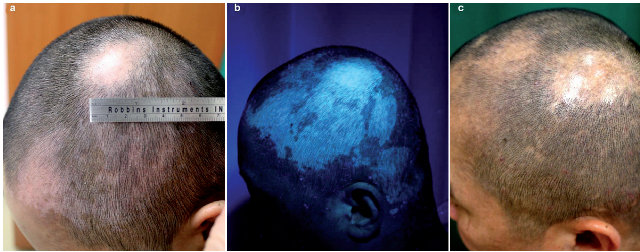
Fig. 2. (a) Vitiliginous lesions appeared on the scalp after application of diphenylcyclopropenone. (b) The lesions were accentuated on Wood's lamp examination. (c) After 4 months narrow-band ultraviolet B treatment, the vitiliginous lesions had disappeared almost completely.

tolerated, but does have side-effects. The most frequent side-effects of DPCP described in the literature are local eczema with blistering, regional lymphadenopathy, and contact urticaria. Rare and more serious effects include an erythema multiforme-like reaction, hyperpigmentation, hypopigmentation, and vitiligo (3).