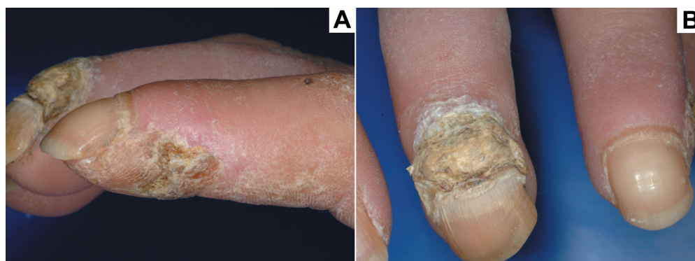
Fig. 1. Severe hyperkeratosis covering ulcers on the proximal nail fold of (A) the right middle and (B) the index fingers.

DUs, which are present in approximately 25% of patients with SSc in Germany (1), are very painful and may have enormous negative impact (2). Amanzi et al. (3) classified DUs as follows: pure DUs (48.6% of 1,614 analysed lesions), and DUs derived from pitting scars (44.1%), calcinosis (6.8%), or gangrene (0.8%). Some of the DUs were hidden behind hyperkeratosis (3). According to this classification, our patient had