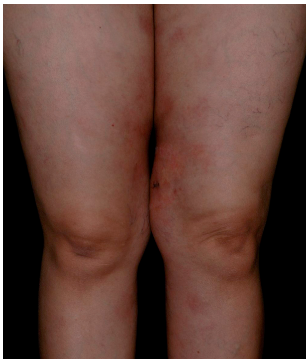
Fig. 1. A 42-year-old Taiwanese woman with increasing number of erythematous indurated tender plaques over both the lower extremities for 7 months.

A comparison with six previously reported cases, as shown in Table SI (available at http://www.medicaljournals.se/acta/content/?doi=10.2340/0015555-1083 ) a female to male ratio of 2.5:1 and an age range from 23 to 71 years (median 42 years). Dermatological manifestation was observed in 6 (86%) cases, including erythematous plaques or nodules over the extremities (6