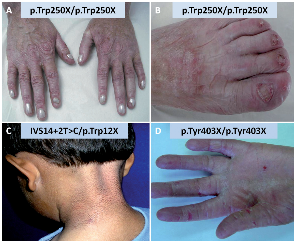
Fig. 1. Clinical features of Kindler syndrome (KS). (A and B) Marked skin atrophy on dorsal aspect of hands and feet of a 42-year-old individual (subject 2) with KS who harboured the homozygous FERMT1 mutation, p.Trp250X/p.Trp250X. (C) Poikiloderma involving the neck of a 10-year-old individual (subject 1) with compound heterozygous FERMT1 mutations IVS14+2T>C and p.Trp12X. (D) Palmar hyperkeratosis and erosions in a 9-year-old subject (subject 4) with the homozygous FERMT1 mutation, p.Tyr403X/p.Tyr403X.