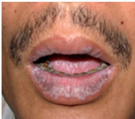
Fig. 1. Irregular plaques with white lacy streaks on the upper and lower lips.

Two months after radiotherapy, the patient was noted to have developed white plaques on his lower lip. These plaques slowly enlarged and the upper lip was affected over the next month (Fig. 1). No concurrent lesions were observed on the buccal mucosa, tongue, genital mucosa, skin, scalp, nails or conjunctivae. The