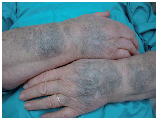
Fig. 1. Macular hyperpigmentation on both forearms and partial melanonychia of the right thumb nail.

A 75-year-old woman with a history of hydroxychloroquine-treated cutaneous lupus erythematosus presented with a bilateral sharply demarcated macular hyperpigmentation on both forearms (Fig. 1) and a partial melanonychia of the right thumb nail. This pigmentation disorder developed gradually over a 6-month period. No retinal pigmentation and no systemic disorder were revealed. Dermoscopy of the nail plate and nail bed showed pigment deposition.