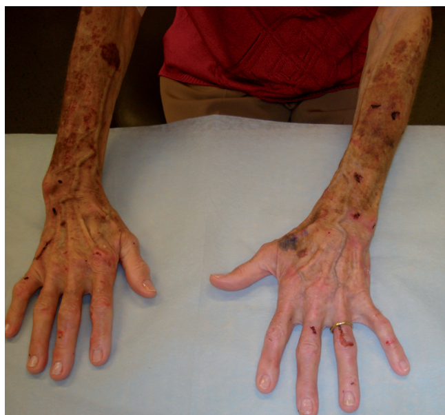
Fig. 1. Haemorrhagic blisters, erosions, crusts and milia on the back of the hands and the distal forearms of patient 1.

confirm and refine the previous diagnosis. As shown in Table I, urinary porphyrin precursors, \delta -aminolaevulinic acid (ALA) and porphobilinogen (PBG) were within the normal range. Urinary porphyrins were slightly increased. In addition, an elevated content of coproporphyrin isomer III was observed in the faeces. Plasma fluorescence emission scan identified a peak at 624–626 nm, which is characteristic for VP. Subsequent molecular analysis of the PPOX gene revealed a frameshift mutation, 1082–1083insC, stop+18, thereby confirming the diagnosis at the molecular level (data not shown).