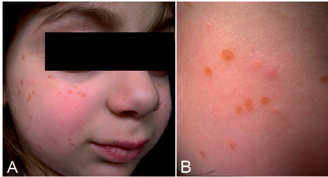
Fig. 1. (A) The child's face covered with orange-brown macules, scattered on the cheeks and periorbital region. (B) The macules are discrete and poorly circumscribed.

What is your diagnosis? See page 558 for answer.