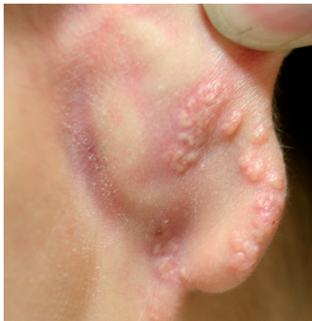
Fig. 1. Well-demarcated, 3–6 mm diameter, skin-coloured to yellowish, centrally umbilicated papules, with the majority coalescing into plaques.

What is your diagnosis? See next page for answer.