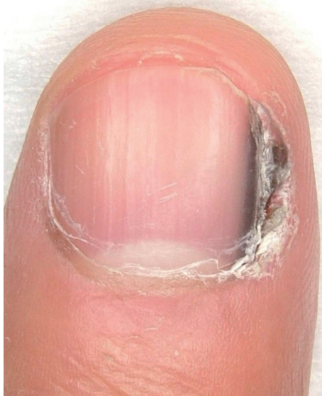
Fig. 1. A black streak on the nail and hyperkeratotic black macule on the lateral nail fold of the right index finger.

A previously healthy 41-year-old Japanese man presented with a 2-mm-wide black streak on the nail and a 2-mm-wide, hyperkeratotic black macule on the lateral nail fold of the right index finger, which had been present for more than 2 years (Fig. 1). The Hutchinson sign was not present. There was no evidence of viral warts anywhere, including on the hands, feet and genital region, and no dark streaks in the nails of his other digits. Dermoscopic examination of the nail plate revealed longitudinal black pigmentation with