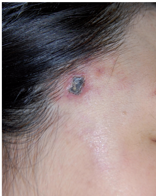
Fig. 1. A black-crust ulcer with surrounding palpable tender nodules on the right temple.

A 42-year-old woman presented in June 2008 with an ulcer covered by a black crust and surrounding palpable tender nodules on the right temple (Fig. 1). In September 2006, she had received collagen injections into both temples, administered by an unlicensed practitioner. About 6 months later, she detected palpable nodules on both temples. She visited the unlicensed practitioner again, and received intralesional injections of an unknown material (described as a neutralizing agent) into both temples. Thereafter, her face became gradually more swollen, and an ulcer developed on her right temple. The patient was otherwise