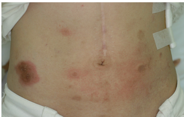
Fig. 1. Multiple pruritic annular plaques with central areas of regression. Wheals are present on the periphery. The largest plaque on the right side is a cancer metastasis confirmed from a previous biopsy.

The current rash, of 2 weeks duration, consisted of multiple annular erythematous plaques with central areas of regression and peripheral wheals (Fig. 1). To