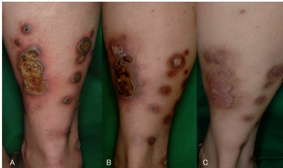
Fig. 1. Clinical course of the left posterior surface of the patient's leg. (A) Prior to NBUVB irradiation. (B) After 10 sessions of irradiation, epidermal regeneration was observed under the keratotic plugs, and resolution of the keratotic plugs left scarring and pigmentation. (C) After 20 sessions of irradiation (total 18.96 J/cm 2 ), all of the nodules completely disappeared.

As treatment with topical corticosteroids worsened the skin eruptions, NBUVB phototherapy was commenced. A fluorescent lamp (TL01) emitting a wavelength of 311 ± 2 nm mounted in a cabinet (UV7001K, Waldmann, Villingen-Schwenningen, Germany), was used. The narrow-band minimal erythema dose (nMED) was 1.2 J/cm 2 . Irradiation of the whole body surface except for the genital region was commenced at 70% MED (0.8 J/cm 2 ), and the therapeutic dose was increased by 10% at the second irradiation, as per the standard regimen for psoriasis. At the third irradiation (0.96 J/cm 2 ), the erythema decreased, and irradiation was continued at the same dose, 3 times a week. Epidermal regeneration under the keratotic plugs was observed; resolution of the keratotic plugs left behind scarring and pigmentation (Fig. 1B). After 20 exposures (total 18.96 J/cm 2 ), all of the nodules disappeared completely (Fig. 1C). Two years after the treatment, there has been no recurrence.