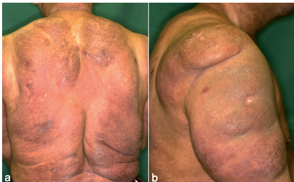
Fig. 1. Large symmetrical lipid deposits of soft and spongy consistency and diffuse scaling erythematous lesions with lichenification in: (a) the back; (b) shoulders and proximal upper extremities.

Complete blood counts were normal. A liver function test showed isolated elevation of \gamma -glutamyl transpeptidase of 88 IU/l (normal, 4–36 IU/l). These changes were secondary to the chronic alcoholism. Fasting urate, blood sugar, triglyceride, and uric acid were all within normal limits. Laboratory parameters of glucose metabolism were also normal. Total serum immunoglobulin E (IgE) was 15,000 IU/ml (normal 0–170 IU/ml). Specific IgE positivity was assessed by radioallergosorbent test (RAST; UniCAP, Pharmacia Diagnostics, Uppsala, Sweden). The patient was positive for five aeroallergens according to RAST testing. His serum RAST for house dust and dust mite-specific IgE was class 6, strongly positive (more than 100 UA/ml; normal, less than 0.34 UA/ml, respectively). Chest roentgenogram was normal. Magnetic resonance imaging showed a symmetrical swelling of the well-demarcated subcutaneous fat tissue in his proximal upper extremities