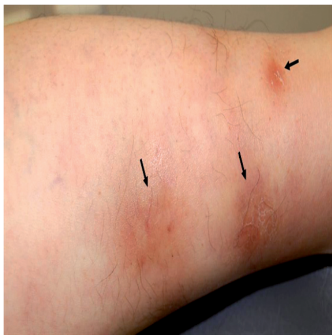
Fig. 1. Appearance of the lesion, with indurated, erythematous nodules 20 mm in diameter on the left shin.

A 26-year-old woman presented in March 2008 with a 2-week history of recurrent painful erythematous nodules and swelling on both legs, and myalgia of the calves (Fig. 1). She had a 3-week history of general weakness and fatigue. In 2004, the patient had presented with fatigue and fever, and was subsequently diagnosed with AIH based on liver biopsy and serology results. In 2004, on admission to our hospital, several laboratory tests showed abnormal results, including aspartate transferase (AST) 601 IU/l (normal <40 IU/l), alanine transferase (ALT) 1464 IU/l (normal <40 IU/l), gamma glutamyl transferase 62 IU/l (normal 8–35 IU/l) and immunoglobulin G (IgG) 1870 mg/dl