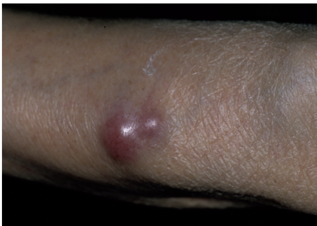
Fig. 1. A red nodule on the left forearm.

figures were frequently seen (Fig. 2). Histopathological findings of the nodule were similar to those of PCNSL (Fig. 3). Immunohistochemically, the tumour cells were positive for CD20 and CD79a, but negative for CD3, CD5 and CD10 (not shown), suggesting DLBCL. The staining results were compatible with those of PCNSL. Based on these findings, a diagnosis of subcutaneous metastasis due to PCNSL was made. We recommended excision of the tumour, but the patient and her family refused treatment and detailed examination. Ten months later, visual disturbance developed and local recur-