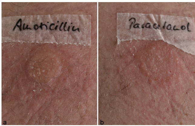
Fig. 2. Patch test reactions to (a) amoxicillin and (b) paracetamol (day 3) showed papular infiltrate with some pustules, reminiscent of acute generalized exanthematous pustulosis.