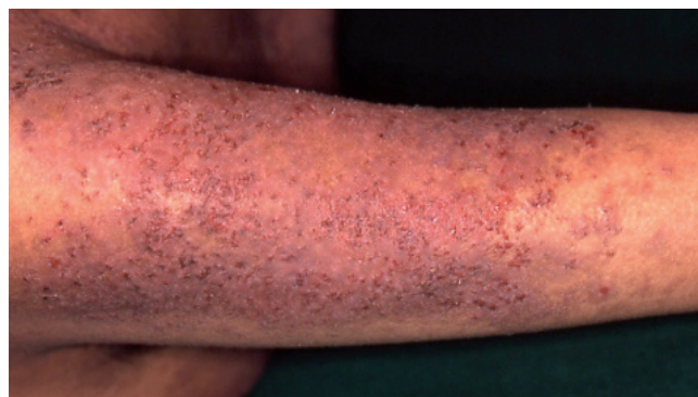
Fig. 1. One week after admission. Disseminated keratotic papules were noted on the patient's trunk and extremities.

Six weeks later, he was readmitted because of the recurrence of painful erosive skin lesions accompanied by a high fever and dyspnoea (Fig. 3). The results of bacterial cultures from erosive skin revealed P. aeruginosa and others. Treatment with intravenous minocycline hydrochloride 200 mg/day and topical application of antibacterial ointment were effective in improving the infection. The papules and erythema remained