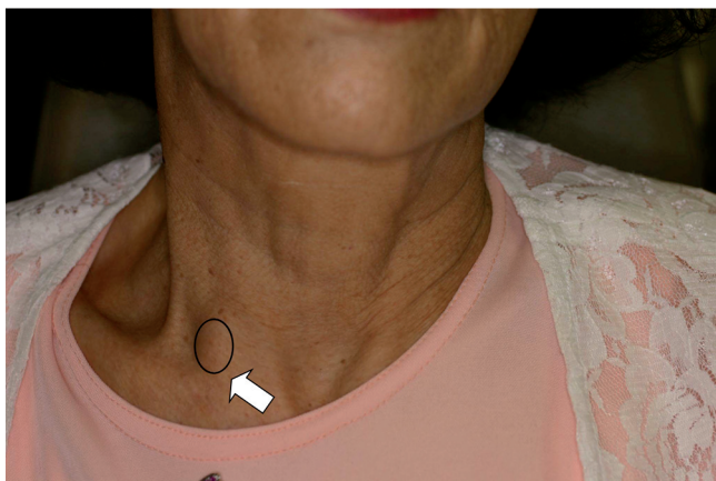
Fig. 1. A mass in the right supraclavicular fossa with the appearance of a subcutaneous tumour (arrow). Pulsation of the mass could not be detected clearly because of the patient's normal blood pressure.

A 73-year-old woman presented at our hospital complaining of an anterior neck mass that she had noticed only 4 weeks previously. She was not obese (BMI=19.3), nor was her medical history regarding hypertension, hyperlipidaemia and syphilis particularly remarkable. She had no dyspnoea or dysphagia, but her husky voice and severe throat discomfort were clearly alarming. A fibroscopic examination revealed no abnormality in the pharynx or larynx. We palpated a 1.5-cm subcutaneous mass in the right supraclavicular fossa (Fig. 1), but were unable to detect any obvious