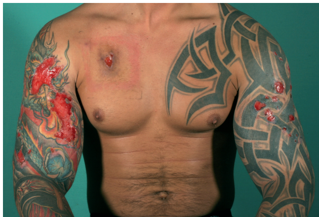
Fig. 1. Bodybuilder with multiple ulcers on his arms as a reaction to injected mineral oil.

To evaluate the possibilities for surgery, magnetic resonance imaging (MRI) of both arms was performed (Fig. 2). MRI gave an almost identical picture to that of ultrasound. The biceps muscles showed small cystic