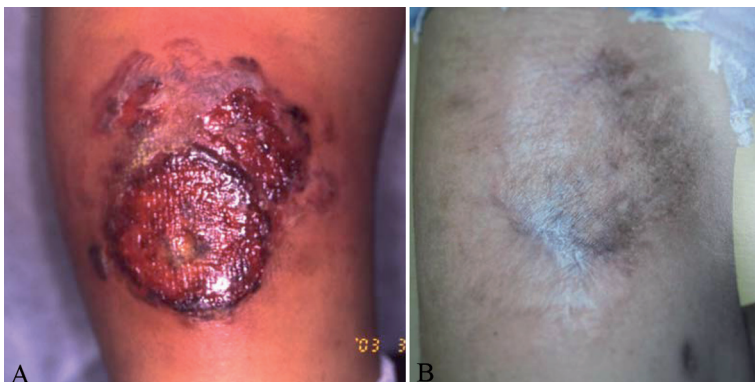
Fig. 1. (A) Clinical appearance of erythematous ulcerated lesions on the right thigh. (B) Six weeks after analogous bone marrow transplantation, pyoderma gangrenosum lesions had resolved, leaving post-inflammatory hyperpigmentation.

The course of PG is unpredictable and the manifestations range from very limited and superficial ulcerations to widespread disease with extracutaneous manifestations. PG is still life-threatening with a mortality rate