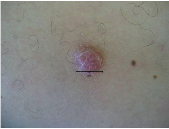
Fig. 1. Appearance of the lesion: reddish, oval nodule, approximately 2 cm in diameter, not ulcerated.

py with cyclosporin A (175 mg/day) and azathioprine (100 mg/day) was referred to our unit. Skin examination revealed a reddish oval nodule, about 2 cm in diameter on the lateral side of the left leg (Fig. 1). An excisional biopsy of the lesion was performed and histological analysis showed an atypical, non-epidermotropic cellular infiltrate of the entire dermal compartment; this infiltrate was composed of large anaplastic cells with eosinophilic cytoplasm and numerous and prominent