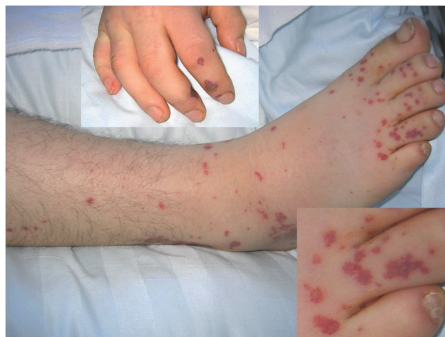
Fig. 1. Multiple disseminated non-blanching red-violet papules on the hands and feet: clinical features of a systemic vasculitis.

developed over the past 2 weeks. His medical history included weekly heroin and cocaine abuse for 2 years preceding the onset of his first systemic signs and symptoms. The cocaine sniffing had caused destruction of his nasal septum. Progressive cough, dyspnoea, fulminant pneumonia and, later, decreased renal function and deterioration of his general condition led to admission to the intensive care unit (ICU). Skin findings included cutaneous nodules and plaques on arms and legs, which persisted on diascopy (Fig. 1). The initial chest X-ray showed dense infiltrates in the right upper and middle lobe compatible with pneumonia and intra-alveolar haemorrhage (Fig. 2). However, a complete microbiological work-up including bronchoscopic sampling did not reveal an infectious agent. Pathological laboratory findings included leukocytosis 36.2 g/l (normal < 11.0), d-dimers 18.9 mg/dl (< 0.5), creatinine 1.5 mg/dl ( \leq 1.2), creatinine clearance 49 ml/min (80–120) and C-reactive protein (CRP) 19.0 mg/dl (< 0.5). A skin biopsy revealed leukocytoclastic vasculitis of small and medium-sized dermal vessels, with fibrinoid vessel wall necrosis, extravasated red blood cells, and a neutrophil infiltrate with nuclear dust. Direct immunofluorescence revealed large deposits of IgM with lesser amounts of IgG, IgA and C3 at small cutaneous vessels (Fig. 3). Because of