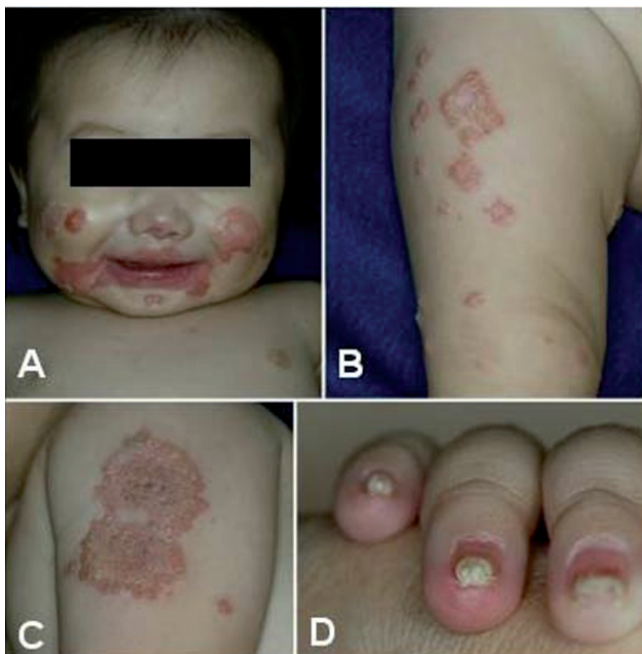
Fig. 1. Clinical manifestations. (A and B) Reddish plaques of varying sizes with scale/crust on the face and extremities. (C) Similar lesions at the BCG vaccination site. (D) All fingernails show subungual hyperkeratosis with moderate erythema.

A 6-month-old girl presented with skin eruptions that appeared following BCG vaccination that had been carried out at a local public health centre. Plaques initially appeared on the vaccination site one month after vaccination, followed by the appearance of multiple plaques on the face and extremities during the next month. Physical examination revealed multiple red papules and well-defined plaques covered by whitish-yellow scale/crust on the face and extremities, as well as at the site of BCG vaccination (Fig. 1A–C). The nails of the fingers and toes showed subungual hyperkeratosis (Fig. 1D). The patient's medical history included congenital mitral valve insufficiency, and