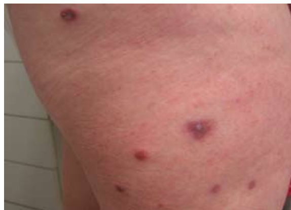
Fig. 1. Flat-topped or dome-shaped violaceous or purpuric papules and plaques distributed over the buttock and thigh.

Two months later the patient developed new erythematous or urticarial-looking asymptomatic plaques on her arms, hands and thighs, and she mentioned that she had had similar lesions in the past. There were no clinical features of Sweet's syndrome. A skin biopsy revealed features of florid interstitial neutrophilic dermatitis indistinguishable from those of rheumatoid neutrophilic dermatitis; there were no histopathological features of leukocytoclastic vasculitis. Interestingly, several lesions showed features of both RAE and neutrophilic dermatitis. Three months later the patient developed a necrotic, non-inflamed plaque on her left leg that resulted in a punched-out ulcer. The lesion was not caused by trauma, and coincided with a positive aCL IgG (25; normal <10) and IgA (18; normal <10) and, for the first time, an antinuclear antibody positivity (1:320). In the following 6 months the patient developed three more ulcers on the left ankle and left medial malleolus. Biopsies of the ulcers showed fibrinous material in numerous vessels and focal intravascular thrombi formation; there