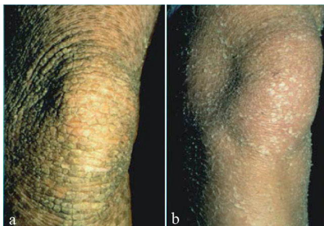
Fig. 3. Effects of systemic retinoid therapy in lamellar ichthyosis. Before (a) and after (b) one month of acitretin 1 mg/kg/day.

In all types of ichthyosis retinoid therapy induces a decrease in skin thickness and scaling, which begins about 1–2 weeks after the initiation of therapy. Thickening recurs after the retinoid is discontinued. Com-