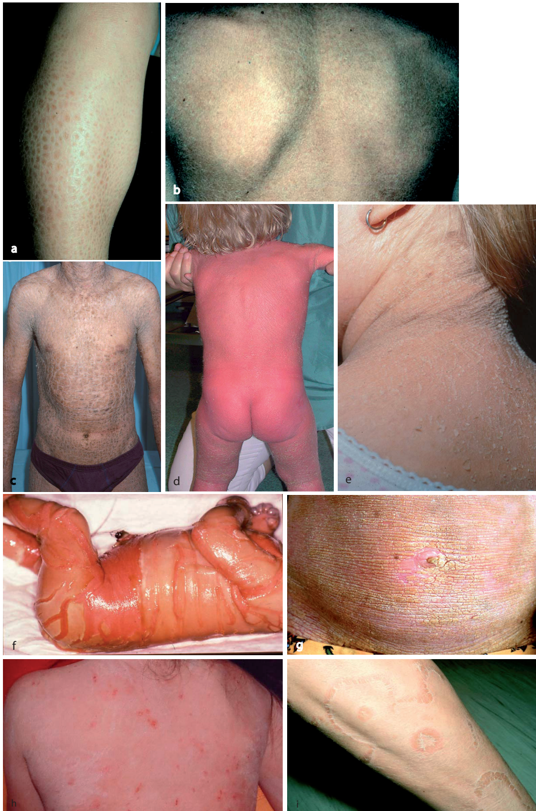
Fig. 1. Clinical appearance of various subtypes of ichthyosis: (a) ichthyosis vulgaris, (b) X-linked ichthyosis, (c) lamellar ichthyosis (LI) due to TGMI mutations, (d) congenital ichthyosiform erythroderma (CIE), (e) congenital ichthyosis with fine/focal scaling (CIFS), (f) severe case of collodion baby with associated features of harlequin ichthyosis, (g) epidermolytic hyperkeratosis due to a KRT10 mutation, (h) Sjögren-Larsson syndrome with excoriations, and (i) Netherton syndrome in an adult person showing typical ichthyosis linearis circumflexa. Pictures from the authors file; Some have been previously published (13); Reproduced with permission from Acta Dermato-Venereologica.