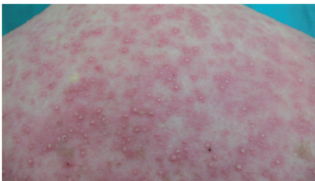
Fig. 3. Case 2: monomorphic cetuximab-induced acneiform eruption on the back.

EGFR is expressed in the epidermis, the sweat gland apparatus and hair follicle epithelium (6), playing a central role in the normal differentiation and development of the hair follicle (8). Because EGFR is expressed in epidermal and follicular keratinocytes, EGFR-blocking agents, such as cetuximab, promote the development of cutaneous side-effects, notably acneiform eruptions, which are reported as occurring in up to 90% of patients (9). Failure of hair follicles to enter the catagen stage observed in transgenic mice expressing an EGFR dominant-negative mutation in the basal layer of the epidermis and the follicular outer root sheath, which