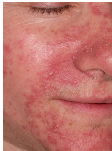
Fig. 1. Case 1: diffuse facial erythema associated with papulopustular lesions, with no comedones.

A 52-year-old woman under treatment with cetuximab was referred to our dermatology clinic for an acneiform eruption that had appeared approximately one week earlier and was associated with mild itching. The patient had undergone surgery for a metastatic colorectal adenocarcinoma (CCR) 4 years previously, and since that time had been treated by different polychemotherapy regimens. In January 2006, because of disease progression, a combined therapy was initiated, consisting of cetuximab at a dosage of 400 mg/m 2 for the first administration followed by 250 mg/m 2 from the second administration on, and irinotecan (90 mg/m 2 ) both given intravenously every week. Three days after the second administration of cetuximab, the patient experienced a diffuse acneiform eruption on the face, neck, trunk and upper extremities. Physical examination showed a diffuse facial erythema associated with slightly itchy erythematous papules and pustules, with no visible comedones (Fig. 1). At that time, the patient was not receiving any other drug. The acneiform eruption was classified according to the National Cancer Institute Common Terminology Criteria for Adverse Events version 3.0 as grade 2. Neither bacteria nor fungi were found on culture of pustular lesions. Histopatholo-