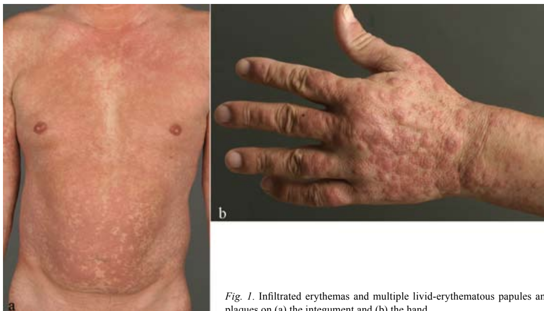
Fig. 1. Infiltrated erythemas and multiple livid-erythematous papules and plaques on (a) the integument and (b) the hand.

A 48-year-old man was referred to our clinic with recurrent oedema and swelling of the face and neck, which had occurred during the last 3 months. In addition, he reported generalized itching and erythema. Oral antihistamines had been given on suspicion of Quincke's oedema with chronic urticaria, but they did not control the symptoms. He presented with infiltrated erythemas and multiple livid-erythematous papules and plaques on the integument (Fig. 1a) including the extremities (Fig. 1b) and the soles of his feet. There was generalized lymphadenopathy.