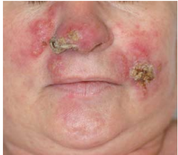
Fig. 1. Infiltrated and ulcerated nodules of the face with necrosis of the outer edge of the nostril.

mucosa and non-specific multiple pleural micronodules on computerized tomography (CT) scan. Tests for auto-antibodies, including anti-cANCA, and for infectious agents (mainly mycobacteria) in lesions and in sputum were repeatedly negative (the last negative cANCA auto-antibodies test was performed in January 2007) apart from the nasal carriage of S. aureus identified at initial evaluation. Morphological (CT scan and abdominal ultrasound) and biological (renal function, urine analysis) renal investigations were normal and