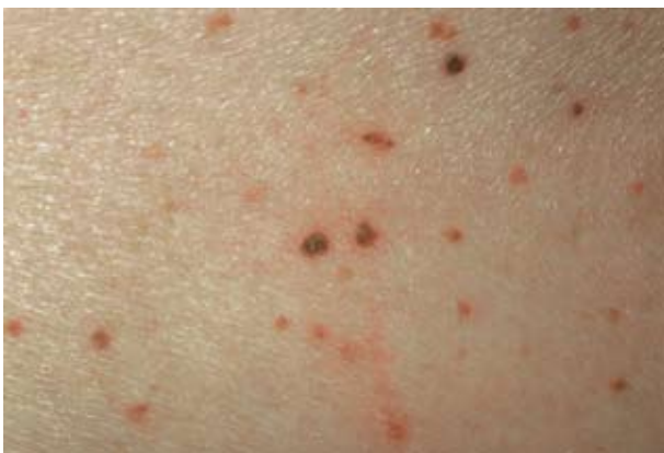
Fig. 1. Multiple erythematous papules on the back.

Physical examination revealed erythematous and excoriated papules located on the back (Fig. 1). A skin biopsy punch was made. Microscopic examination showed epidermal acanthosis, suprabasal clefts and focal acantholysis with dyskeratosis (Fig. 2). In the dermis there was a lymphocytic infiltrate. The histological findings resembled Darier's disease. Two months after consultation the patient underwent renal transplantation, with resolution of lesions one month later. After one year of follow-up, the patient had not developed any new lesions.