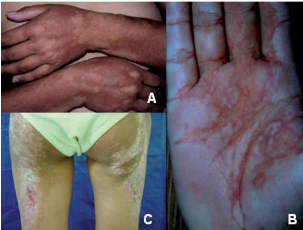
Fig. 1. (A) Brownish plaques on the dorsal side of the forearms of case 1. (B) Palmar lesions with diffuse infiltration sparing the palmar crests in case 1. (C) Erythematous and squamous plaques on the buttocks of case 2.

improvement in the texture and dimension of the skin lesions. After one year of follow-up there were no active lesions and no new plaques.