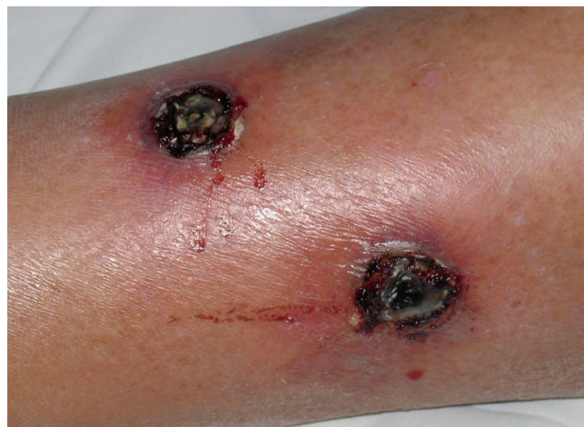
Fig. 1. Two well-delimited, rounded, ulcerous lesions with necrotic centres and erythematous borders on the anterior aspect of the left leg.

Histological study of a skin sample revealed a marked epidermal and dermal necrosis with an intense inflammatory infiltrate mainly comprised of neutrophils. Many hyaline-branched septated hyphae were seen on the surface of the lesion and extending deeply into the dermis, with both haematoxylin-eosin (H&E) and periodic acid-Schiff (PAS) staining (Fig. 2).