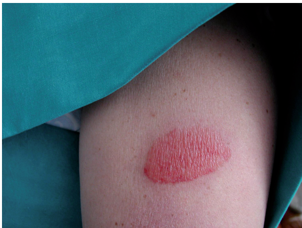
Fig. 1. Intensely erythematous lesion with an appreciable violet peripheral border and bullous detachment.

There are two forms of PEG-IFN- \alpha : PEG-IFN- \alpha -2a and PEG-IFN- \alpha -2b. Peg-IFN- \alpha -2a is a bulky branched molecule with a molecular mass of 40kD as compared with Peg-IFN- \alpha -2b which is a linear molecule with a molecular mass of 12kD. As a consequence, PEG-IFN- \alpha -2a possesses a greater hemilife and sustains therapeutic levels in the plasma for prolonged periods. This means that PEG-IFN- \alpha -2a alone, or in combination with ribavirin, improves sustained virological responses. Furthermore, therapy with PEG-IFN- \alpha -2a plus ribavirin is associated with better health-related quality of life, because it is associated with significantly less bodily pain, more energy, less disabling fatigue, and fewer limitations in social functioning during the treatment (8).