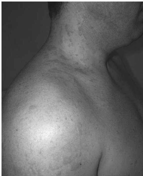
Fig. 1. Urticarial rash.

A 33-year-old man with chronic urticaria without angioedema was admitted to our department complaining of severe urticaria, with large confluent areas of wheals (Fig. 1), lasting for 5 years, intense pruritus, intermittent fever over 38°C, and joint pain involving mainly the knees and wrist joints. Previous treatment with different elimination diets, and H1-antihistamines in standard and increased dosage had been unsuccessful.