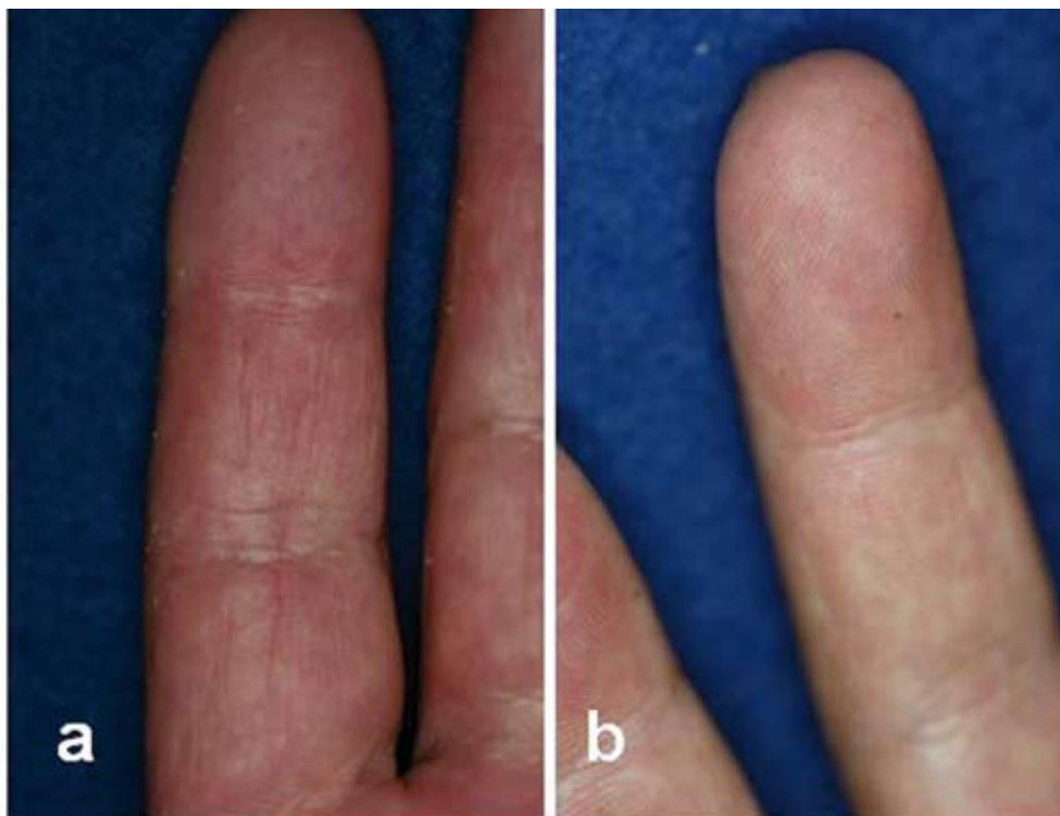
Fig. 1. Spiny keratotic projections on the palmar surfaces (a) before treatment and (b) after treatment with 0.002% tacalcitol.

The treatment of spiny keratoderma has not been established; 5% 5-fluorouracil cream (1) and 12% am-