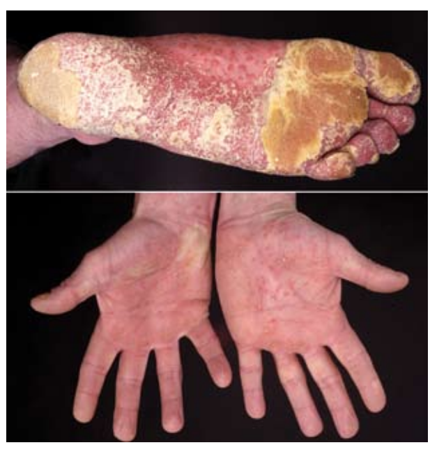
Fig. 1. Pompholyx eczema affecting palms of hands and soles of feet prior to commencing combination antiretroviral therapy.

Although it has been described as part of the immune reconstitution inflammatory syndrome (4), this is the first report of pompholyx as a manifestation of symp-