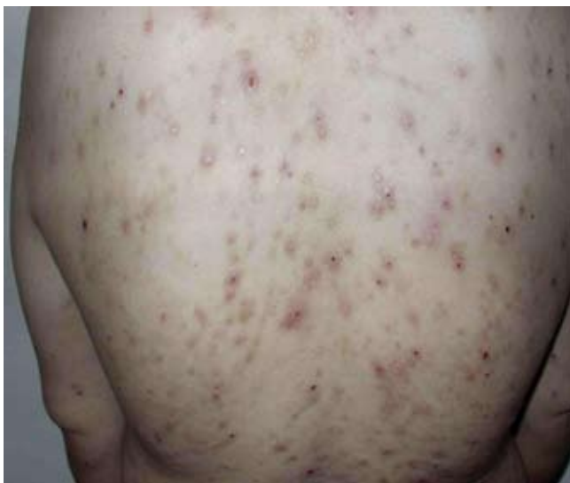
Fig. 1. Skin eruption on the back.

A detailed laboratory examination was carried out. The results were: haemoglobin level 8.3 g/dl (normal 12–14 g/dl), lactate dehydrogenase 678 U/l (normal 125–243 U/l), carcinoma antigen 125 > 600 (normal 0–35). The following values were normal: peripheral